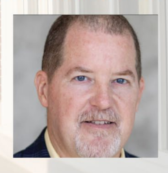
Vice President for Research Compliance